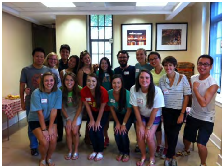
Sigma Alpha Omega Sponsors of October 3rd Lunch