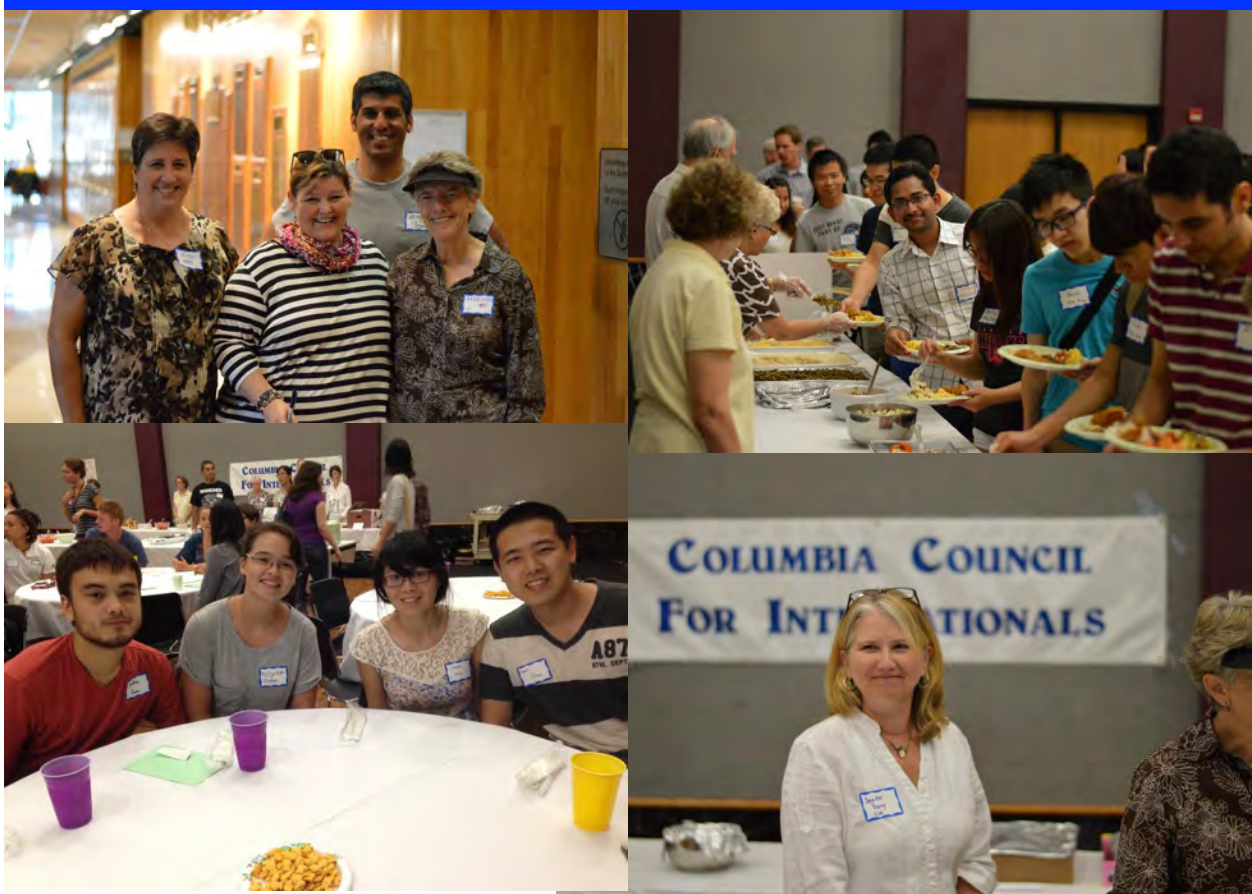
CCFI Annual Welcome Dinner

An evening filled with gleaming smiles, old friends catching up, and new friends being made—CCFI celebrated another amazing welcome dinner! Just under 300 international visitors and guests joined the annual commemoration. On August 14, 2014, students from all over the world convened for an evening of Southern hospitality CCFI style!